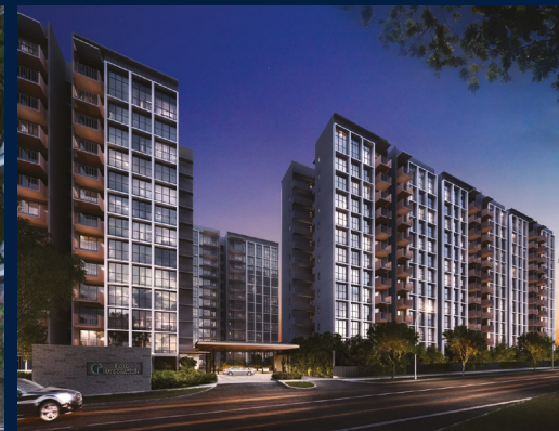
5 - Bedroom Luxury