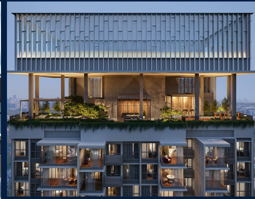
Level : 2 - Bedroom Duplex